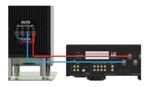
Standard wiring configuration

Bi-wiring can be beneficial in reducing the interaction of the L.F. and H.F. sections of the crossover—moving the common earthing point to the amplifier, rather than the crossover itself, separates the vastly different current characteristics experienced by each drive unit, resulting in a cleaner, more accurate signal for each drive unit. The scale of the improvement is dependent on the crossover's topology—the EVO crossovers are designed to minimise the effect however bi-wiring can still prove beneficial, and is well worth taking time to investigate.